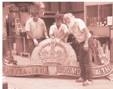
▲ Assembly of the badge sections begins.