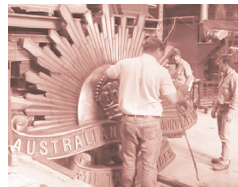
▲ Detailing takes place.