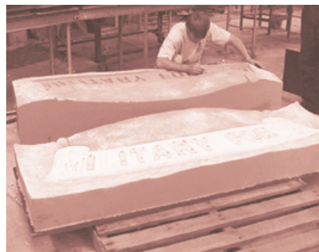
▲ Detailing a section of the mould after extraction of the pattern.

Phoenix Foundry was commissioned to manufacture 60 or so bronze plaques honouring past and present Olympians who come from the Manly area; each plaque shows the name of the sports person, the year and place of the Olympic Games they attended and, of course, their sport.