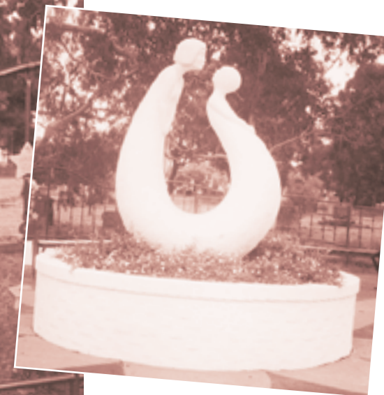
▲ The stunning Mother and Child sculpture is an impressive 2.5 metres and the focal point of this beautiful place of contemplation.