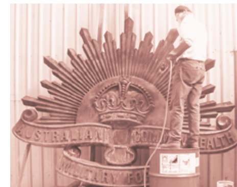
▲ Applying the patina finish to give a handsome aged look.